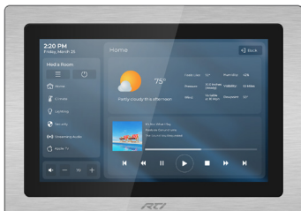
Brushed Aluminum Bezel